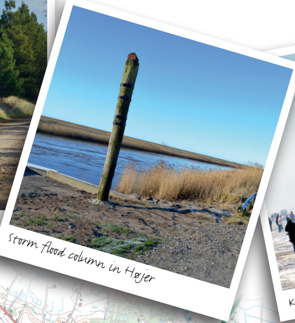
Storm flood column in Højer