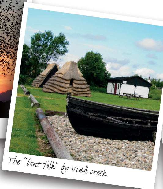
The "boat folk" by Vidå creek