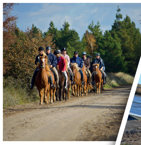
Horse riding on Rømø