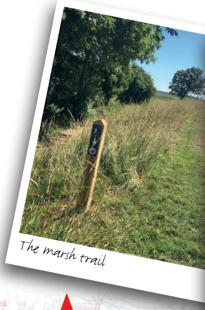
The marsh trail

Rømø island Rømø is an island in the Wadden Sea, approximately 130 km 2 in size. Rømø is the Wadden Sea's largest island, and has been inhabited since the 1200s. For several centuries, wind, weather and sea have shaped this isolated natural haven. Its many different types of habitats offer a home to a rich variety of flora and fauna. The island's numerous paths lead you through a diverse natural and cultural landscape. Whether you are on a bicycle, on horseback, or on foot, Rømø is a truly magnificent experience. In addition, the island's long beaches stretch for miles and are perfect for recreational sports like windsurfing and kite bugging.