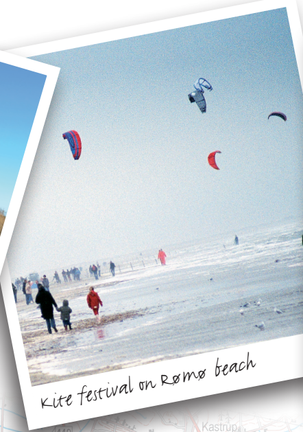
Kite festival on Rømø beach