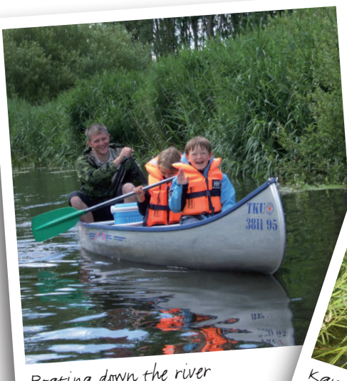
Boating down the river

Canoeing or kayaking is an active, yet relaxing holiday activity. And while paddling, you also get up close to the diverse and beautiful landscape. There are several primitive campsites dotted along the region's watercourses where you can pitch your own tent – or simply go ashore for a break and perhaps a picnic. For more information, pick up the leaflet "Boating down the river in Southern Jutland" (only available in Danish), which describes all the different boating routes.