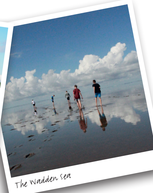
The Wadden sea