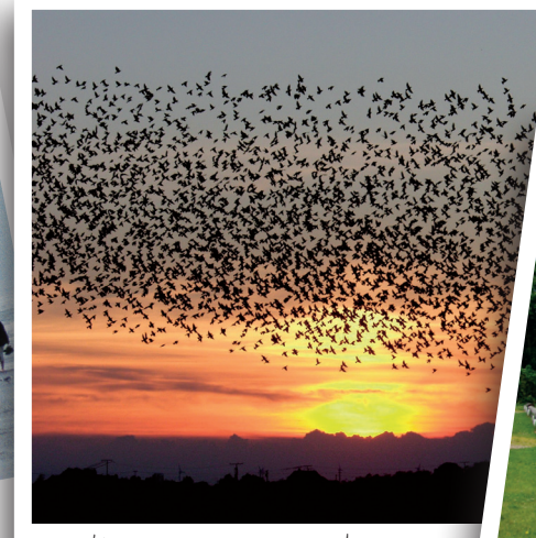
Starlings at Tøndermarken