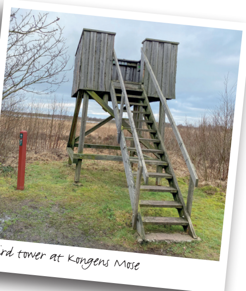
Bird tower at Kongens Mose

Hiking trails have been established that lead through both the forest and the bog. In addition, a bird-watching tower has been set up at Teltkrovej, providing a good observation point for spotting the habitat's various grebes, ducks and waders. To ensure these birds are undisturbed during breeding season, access to the bog is prohibited from 1 March to 1 July. Hikes can start from the parking area in Draved Skov.