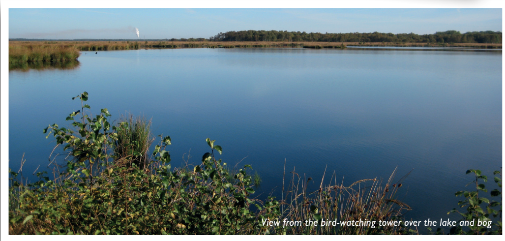
View from the bird-watching tower over the lake and bog