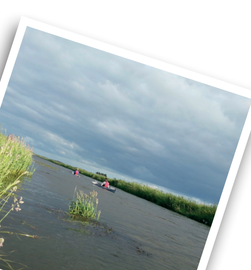
Kayaking on the River Brede Å